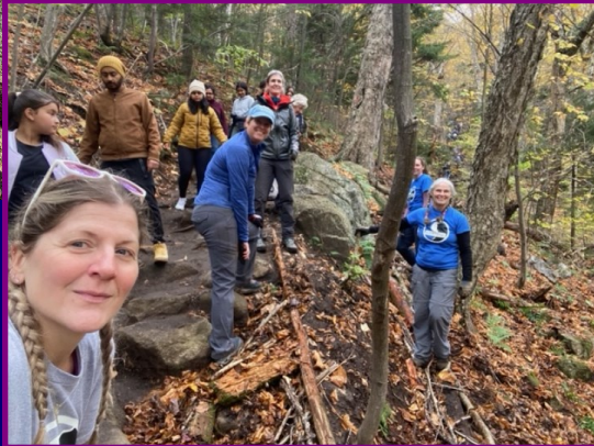
Crowds on Artist Bluff