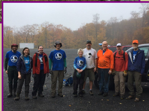
Foggy start to the day October 21st