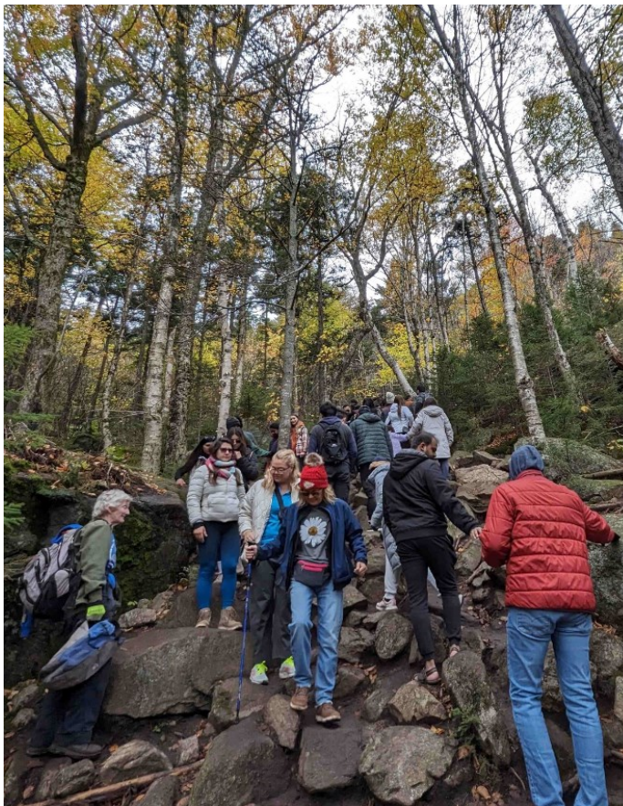
Hundreds of visitors at Artist's Bluff make trail maintenance a challenge