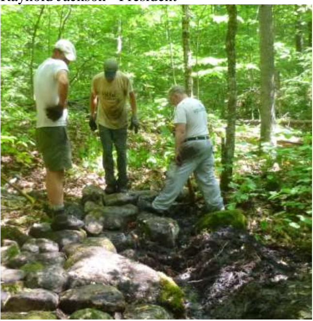
Deer Hill in Chatham