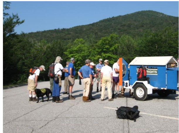
Meeting for the Mt. Pemigewasset Trail workday